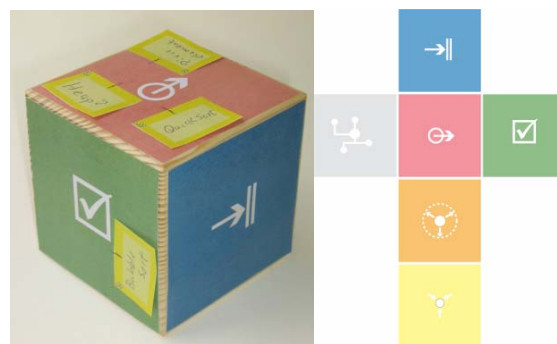
Figure 2. Learner Cube (left) and semantic types (right)

In addition to the semantic phases represented by the sides of the cube, digital paper Post-its can be attached to the sides of the cube (see Figure 2 left). This supports collaboratively collecting semantic items that are important and specific to this actual phase, e.g. relations to a specific learning content. Like Digital Paper Bookmarks, the Post-its are covered with Anoto pattern and can be labeled with a title.