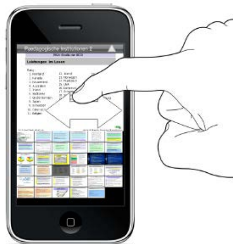
Figure 2: Horizontal navigation within a video.

Either rotating the device into landscape mode or double tapping the current video in the upper part can start playback of the video. When playing the video in landscape mode, users can also navigate through the key frames by simply wiping horizontally.