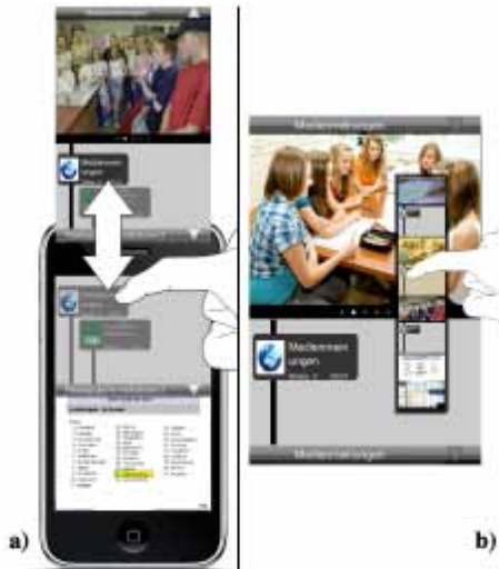
Figure 3: a) Vertical navigation between videos, b) Visualized browsing history

Our navigation support aims at providing an intuitive interaction technique, which allows users to follow hyperlinks and navigate easily within the navigation history. The major challenge hereby is to prevent users from getting lost in too much information presented on a small screen. Lost in Hypertext [1] is a well-known phenomenon, which may occur particularly in this situation. Due to this, we apply a spatial navigation concept: Whenever a video overlaps topically with other videos in the video collection (e.g. two keyframes cover the same topic), available relationships are indicated by a small arrow in the upper right corner of the user interface (see Fig. 2). When the user wipes downwards, the interface is being scrolled downwards, revealing related videos as shown at the bottom of Figure 3a.