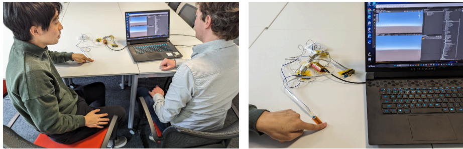
Fig. 1. A mockup of the demo with the organizer and the participant sitting next to each other (left) with the interface (right).

Keywords: Electrotactile stimulation · wearable interface · compliance illusion.