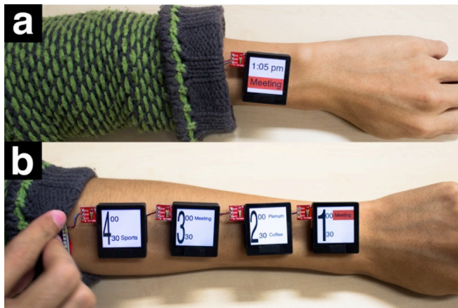
Figure 4. Using the sleeve for semantic zooming. Moving back the sleeve reveals more details about the user’s appointments.

The posture of the forearm in a given context allows the display to be public, personal, a hybrid of both, or even fully private. Leveraging physical postures allows for seamless transitions between these states. We implemented the following example with our prototype, using the IMU to distinguish between different physical postures.