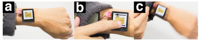
Figure 3. Using the sleeve as a container for storing items. The user can swipe-in an item into the sleeve (a, b) and bring it back by shaking the wrist while lifting the sleeve (c).

The augmented forearm should adapt the visualization depending on which parts of the display are visible. Moreover, it could use the movement of the sleeve as a novel gesture for revealing digital contents, zooming into them, storing and releasing items in an intuitive way.