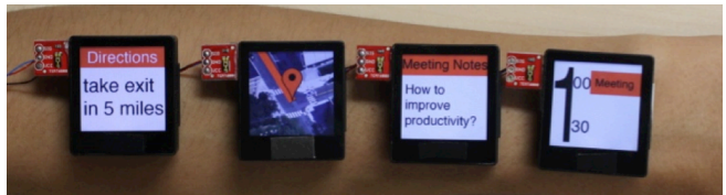
Figure 6. The arm is fully oriented towards the user and serves as a personal display. Here, it shows details of an upcoming appointment.

In Fig. 5a, the user stands in a subway train, holding onto a handrail. The forearm is lifted up and exposed to the public. In this posture, the display shows a graphical overview of the next stops and the current position of the train on the track. As such, the display, which is not visible to the user, displays helpful information for other passengers. When the user rotates the forearm, depending on the rotation angle, certain parts of the forearm may be orientated to the user whereas other parts remain orientated to the public. This posture is illustrated in Fig. 5b. The display becomes hybrid: the lower display becomes personal, since it is rotated towards the user, while the other displays remain public. The personal part of the display gives the name of the station where the user has to get off the train. It can alternatively be used to display other private contents such as those of a smart phone or smart watch. As soon as the user orients his entire forearm towards herself (see Fig. 6), the entire display becomes personal.