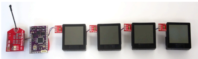
Figure 2. The hardware setup consists of four interconnect displays, each equipped with a light sensor to detect movements of the sleeve. An IMU measures the arm's orientation.

Parts of the forearm may be covered by clothing; so a forearm-worn display might not always be fully visible. The system design should account for this characteristic. It is a natural and common gesture to lift up or push back the sleeve to reveal information, for example checking the time on a wristwatch. Rolling up the sleeve can also have a symbolic value, for instance when one is about to tackle a task.