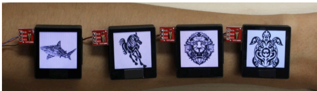
Figure 7. Using the display as digital decoration. Our current implementation shows a digital tattoo.

In future work, we plan to enhance our prototype to feature a more sophisticated distinction between contextual postures and explicit interactions. We will do this by adding an additional camera to the display that recognizes whether the user is looking at the device. Additionally, we plan to augment the lower side of the forearm to have a display that goes all around the forearm. This will allow for integrating our interactions with the circular interactions from prior work [9]. Field studies of this device will eventually provide insights into the arm postures that are used in the wild and into further application cases.